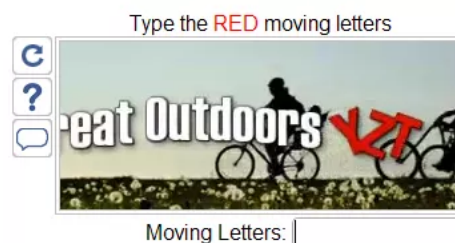
An example still image taken from a NuCaptcha video stream.

The security of Captchas is important because they're used to defend against malicious 'bots, including operators of botnets who try to automatically create accounts on Web e-mail services to send spam. Captchas are also used to curb bot-generated comments and automated ballot-stuffing in online polls.